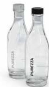
PETALOSA BOTTLES 350/750 ml

Our exquisite and unique range of glass bottles has been meticulously designed with the busy hospitality environment in mind. In both function and form, our bottles provide the ultimate in hygiene requirements whilst simultaneously elevating the user experience for both the venue and the customer.