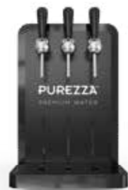
FRIZZANTE 80 MANUAL