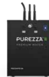
FRIZZANTE 80 BOX