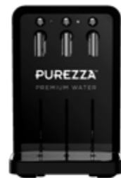
FRIZZANTE 80 ELECTRONIC